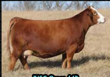
TJSC Onyx 44B