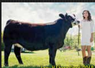
Lazy H Sheza Dandi 206B

Bulls like Hot Sauce and other performance oriented bulls sell third Saturday in April, Maryville, MO. Offering a number of first calf heifer pairs and service age bulls.