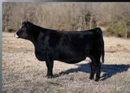
HILB F495D Family