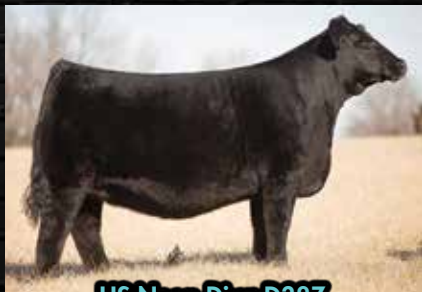
HS Neon Diva D38Z