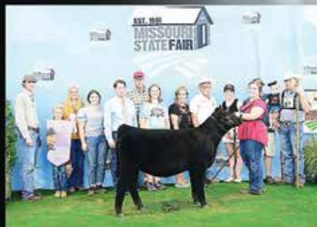
BRDY Liberty's Stand 71D Family

in maternal power, showing presence and breed leading genetic value.