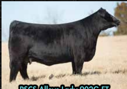
PSCS Alleys Lady 902G ET