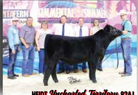
HEIDT Uncharted Territory 92AJ

ASA#3704737 dam OBCC Sadie 92XA sire Colburn Primo 5153