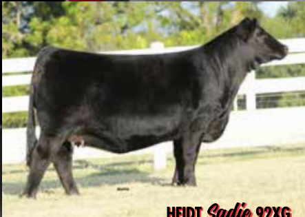
HEIDT Sadie 92XG

ASA#3704737 dam OBCC Sadie 92XA sire Colburn Primo 5153