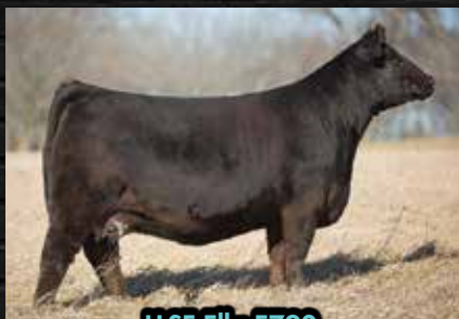
LLSF Ella E792