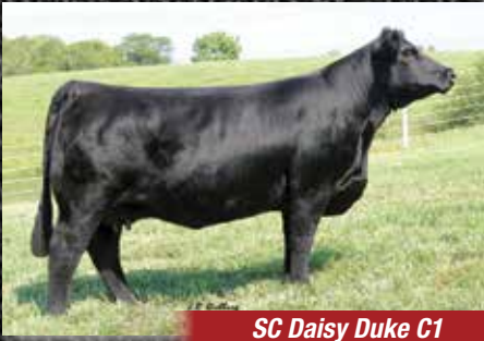
SC Daisy Duke C1

Daisy Lynn x Pays To Believe Shoal Creek raised