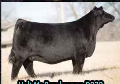
Holt Ms Bandwagon D232