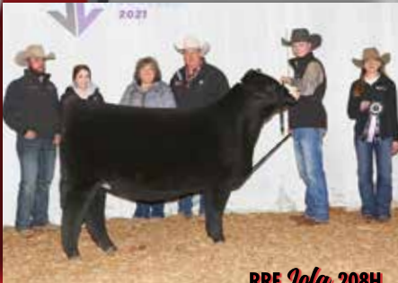
RRF Lola 208H

ASA#4037951 dam OBCC Sadie 92XA sire JSUL Something About Mary 8421