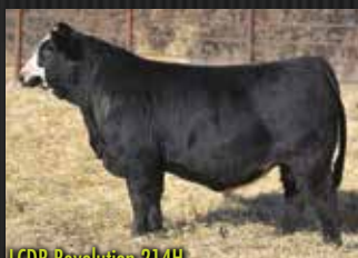
LCDR Revolution 214H

EGL Firesteel x BCLR Baldy E704 (Lock N Load)