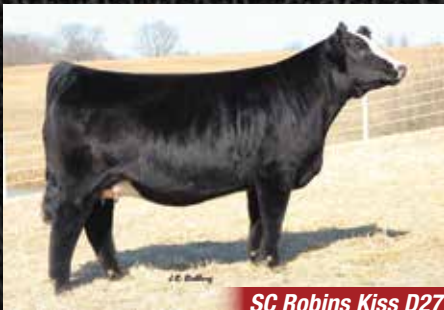
SC Robins Kiss D27

Rhythm x Currency owned with Purdue Beef