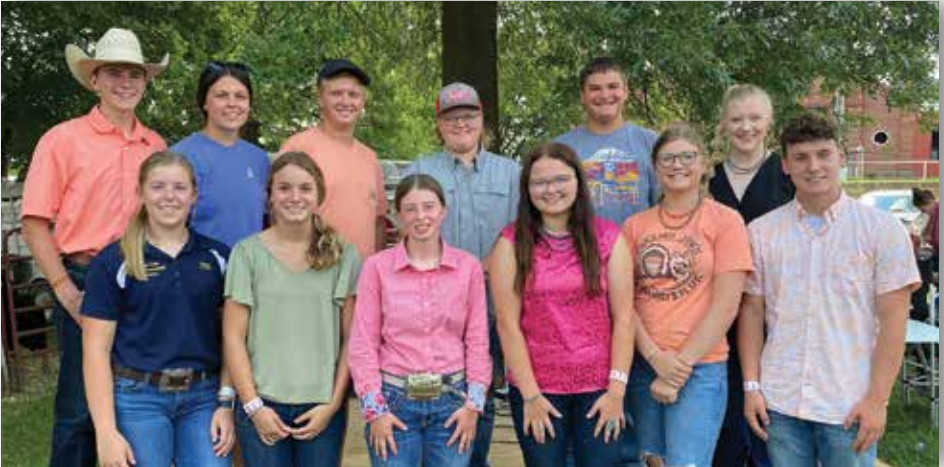
2022 – 2023 Missouri Simmental Association Junior Board