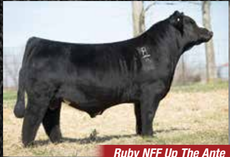
Ruby NFF Up The Ante

Rhythm x Currency owned with Purdue Beef