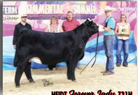
HEIDT Forever Lady 731H

ASA#3752948 dam OBCC Lola 137Z sire SC Pay The Price C11