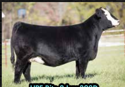
HPF Rite 2 Luv 398D

We believe in sound, productive cattle that excel in the showing and the pasture. Purebred & Percentage Cattle available. Visitors always welcome!